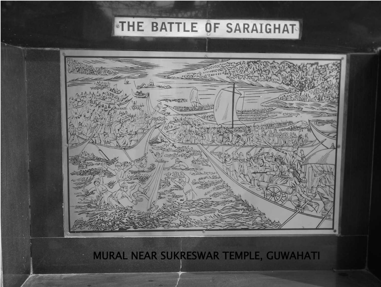
Mural depicting the Battle of Saraighat naval engagement on the Brahmaputra River, located near Sukreswar Temple, Guwahati.

Revered as Ganga Maa , the river embodies myth, polity and geohazards.